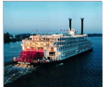
The grand and elegant American Queen