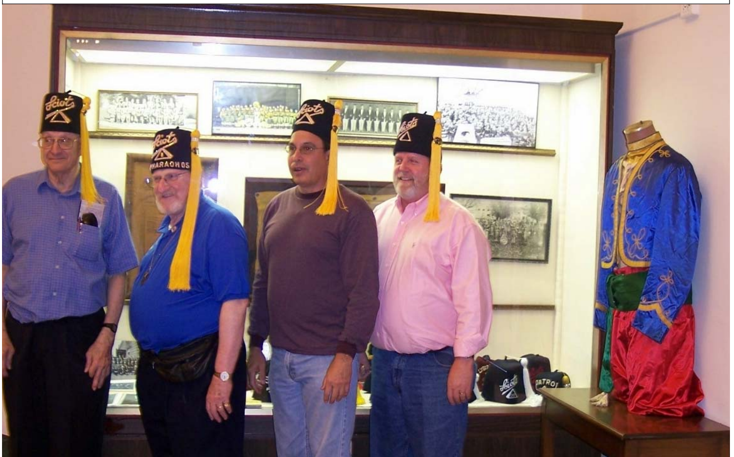
The elected Supreme Pyramid officers at the Sciotry exhibit located within the George Washington National Masonic Memorial